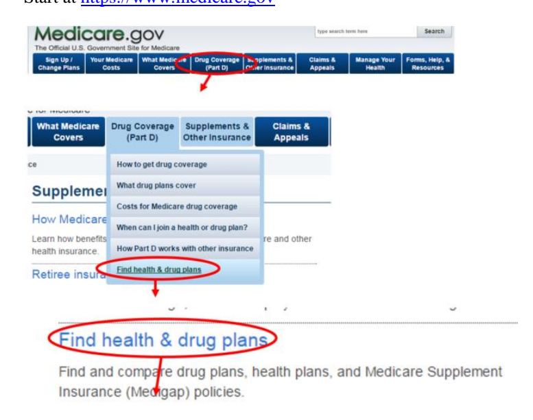
PART D - Drug coverage - The first screen to find plans https://www.medicare.gov/find-a-plan/questions/home.aspx

NOTE: Drug coverage (Part D), supplement(Medigap), vision and dental can be better using up to 4 private companies with Original Medicare. I am using 3 commercial carriers. Medicare Advantage can include some or all of these. Start at https://www.medicare.gov